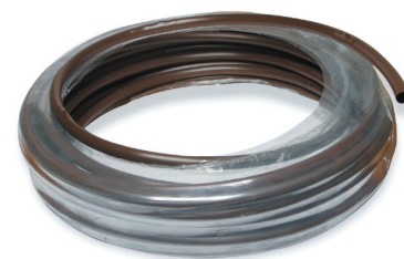
XF Series Dripline