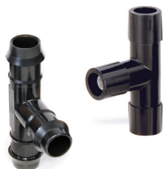
17mm Insert Fitting